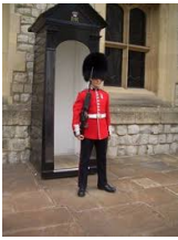
Law Keeps Us in Custody

But before faith came - Before faith came is where all men were as Paul describes for example in Romans 1:18-21.