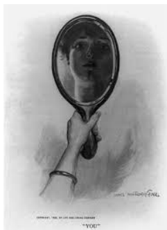
Law Shows Our Sin