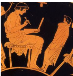
Law Serves As Our Tutor