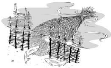
Law "Traps" Us